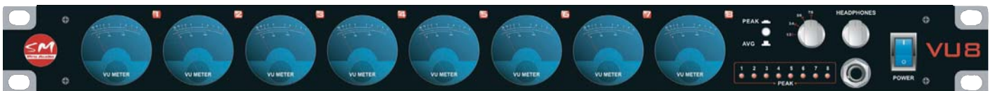
VU8 front panel

The SM Pro Audio VU8 can be used stand alone on your desktop, however it is best installed into "one" standard 19" compatible audio rack-mount unit space.